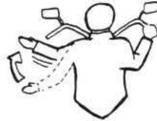
Go ahead and pass me