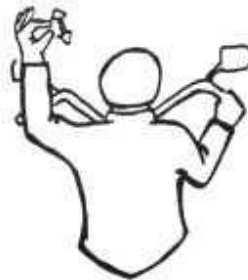
Turn off your turn signals