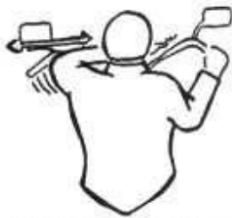
Stop your engines