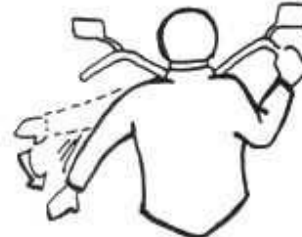
Don't pass me