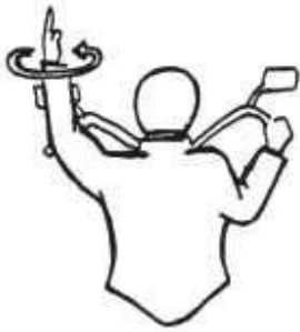
Start your engines