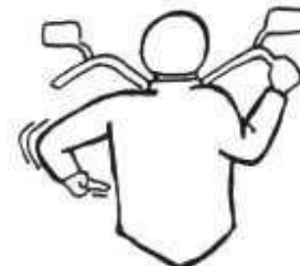
Time for a pit stop